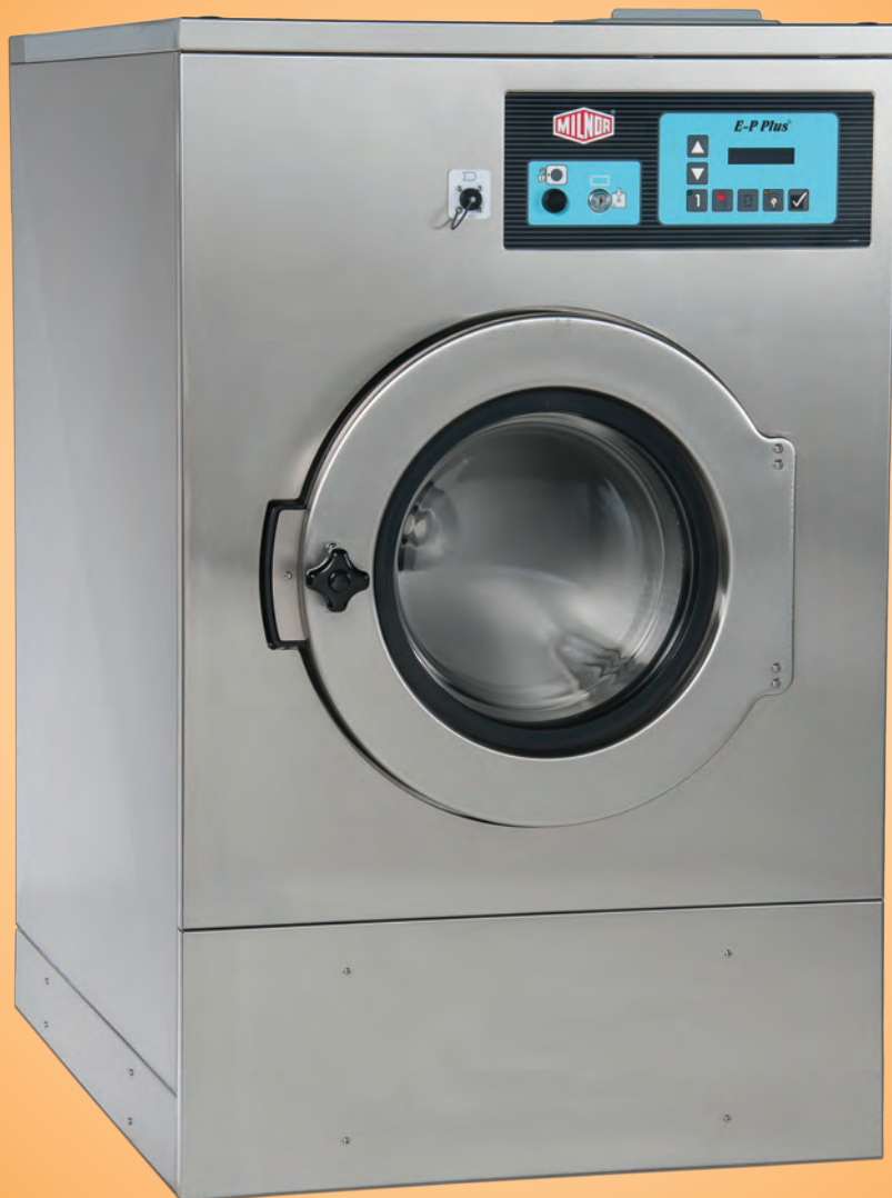
60 lb. capacity model MWR27J5

QUALITY, VALUE, DURABILITY ■ FOUR CAPACITIES ■ EASY-TO-USE CONTROLS