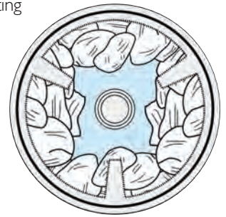
*E-P Plus® only.

5 Milnor's cylinders have efficient inverter drives that produce three speeds for optimum washing.* Three speed washing (along with higher ribs) allows for optimum mechanical action factor (M.A.F.). The distribution speed prevents vibration during extract by evenly distributing the goods to the periphery of the basket. This insures optimum moisture extraction and reduces dry times. The final extract speed is keyed towards today's fabrics. Coupled with a big cylinder (which means a thinner layer of goods for water to pass through) and large perforations, you have better extraction in a Milnor.