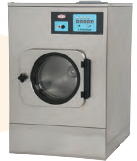
MWR18E4 with E-P One Touch® control

Milnor's value-priced MWR-Series washer-extractors range in capacity from 25-60 lb. (11-27 kg). Available in three controls, the MWR-Series offers savings and flexibility—without compromising the wash quality you expect from a Milnor.